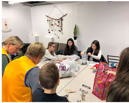
Inspection of glasses