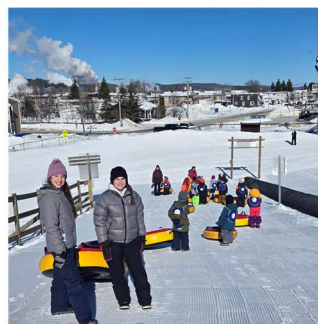
The Leos at the slides

The young people asked them to come back. It's an activity to be renewed!