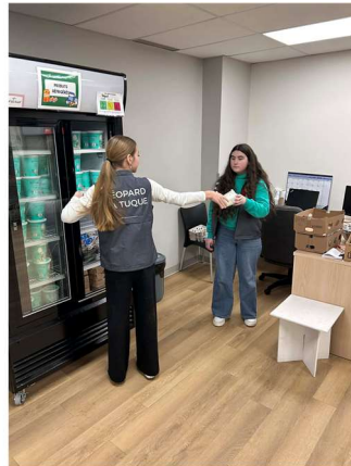
Exchange on future activities

On January 28, the members of the Leo club went to the new premises of the Food Center. The grocery stores of the city of De la Tuque, I.G.A. and Maxi, donate food every week. Beneficiaries can pick up provisions on Tuesdays and Thursdays of each week, from 8:30 a.m. to noon and from 1 p.m. to 3 p.m. The Leos accompanied by their Lions advisors prepared the food, made available to people, the next day being a Thursday. Young members have a lot of fun working in this environment!