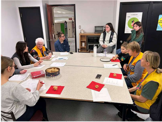
Exchange on future activities

It was a nice meeting Leo/Lion Advisors.