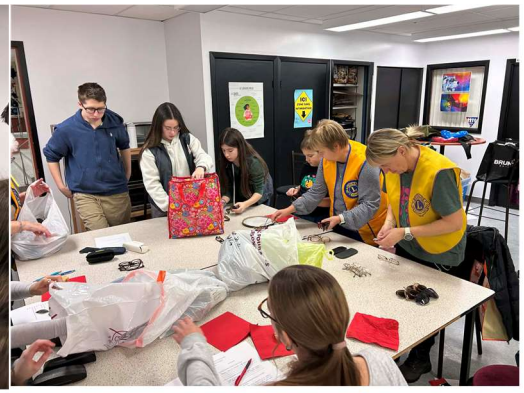
Meeting of January 14, 2026