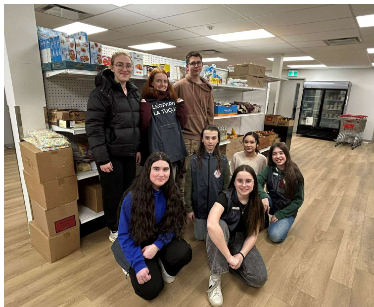
The members of the Leo Club