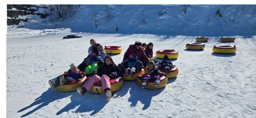
The Leos, the young people of the C.P.E. Lion Lise