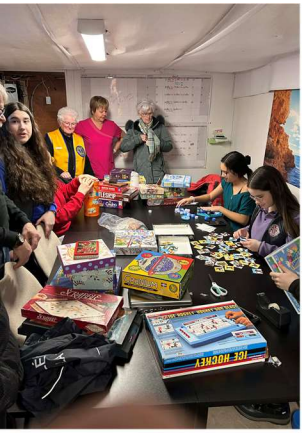
Leo and Lions

So our young Leo members did the tasks proposed by employees (verification of society, puzzles, clothing classification).