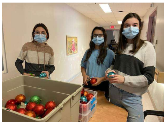
Three Leo of the Draveurs in action.

We officially have a new Leo Club in our District of U-2 having officially received their charter on the 30 last January, but which had started their activities in charity since last October.