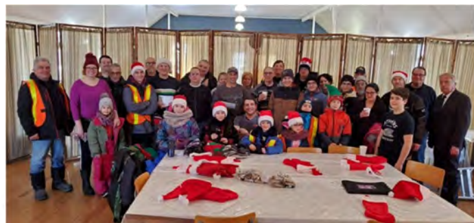
«---- Christmas dinner served to some of the young people of the Astrale hool.