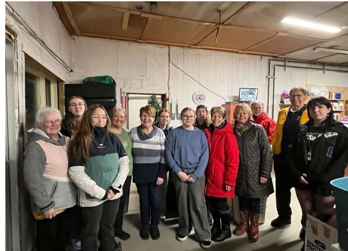
Leos and Lions.

The Leopards were delighted by the experience, they sowed joy on their journey.